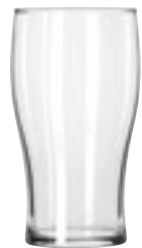
Pub Glass No. 4803 20 oz./59.2 cl./592 ml. H6½" T3½" B2½" D3¾" 2 doz. SCC 346230

There are nearly 9,000 craft breweries in the U.S. today.