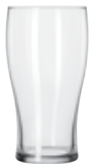
Pub Glass No. 4808 16 oz./47.3 cl./473 ml. H5½" T3" B2¾" D3¼" 2 doz. SCC 373922