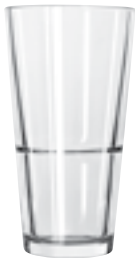
Stacking Mixing Glass No. 15791 20 oz./59.2 cl./592 ml. H6⅞" T3⅝" B2½" D3⅝" 2 doz. SCC 452382