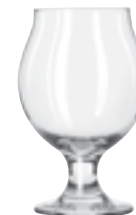
Belgian Beer No. 3807 13 oz./38.4 cl./384 ml. H5½" T2½" B2¾" D3½" 1 doz. SCC 440334