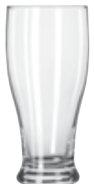
Pub Heavy Base Pub Glass No. 194 16 oz./47.3 cl./473 ml. H6½" T3½" B2½" D3½" 3 doz. SCC 574544