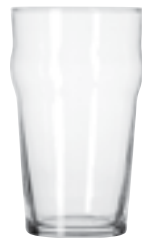
English Pub Glass No. 14801HT 20 oz./59.2 cl./592 ml. H6" T3¾" B2½" D3½" 3 doz. SCC 580118