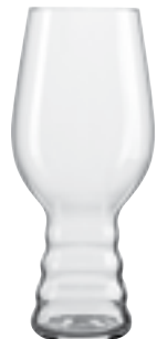
Beer Classics IPA Beer No. 4998052 18.25 oz./54 cl./540 ml. H7¾" T2½" B2¼" D3¼" 1 doz. SCC 4003322252719