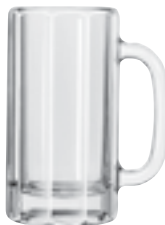
Paneled Mug No. 5016 12 oz./35.5 cl./355 ml. H5⅞" T3⅞" B3¼" D5½" 1 doz. SCC 572366