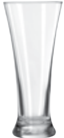
Flare Pilsner No. 19 11½ oz./34.0 cl./340 ml. H7¼" T3⅞" B2½" D3¼" 3 doz./29# • 2.13 cu. ft. SCC 589234