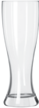
Giant Beers Beer No. 1623 23 oz./68.0 cl./680 ml. H9⅞" T3¾" B3⅞" D3¾" 1 doz. SCC 306593