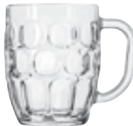
Dimple Stein No. 5355 19¼ oz./56.9 cl./569 ml. H4⅞" T3⅝" B2¾" D5⅝" 2 doz. SCC 508365