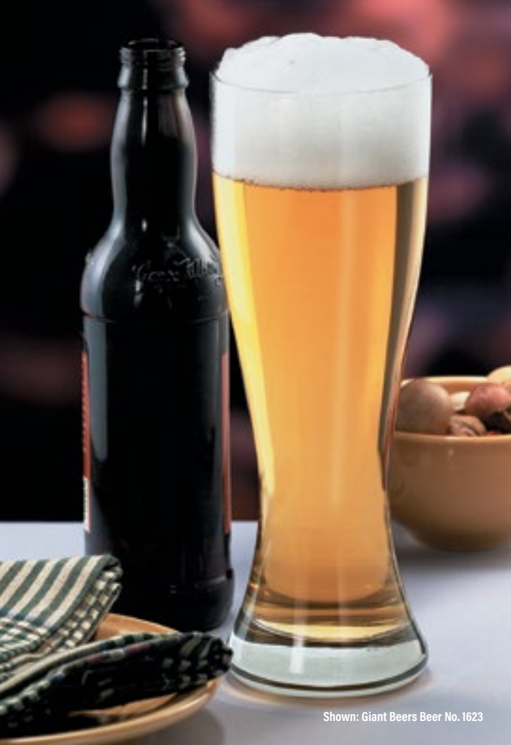
Shown: Giant Beers Beer No. 1623

By 2032, the global non-alcoholic beers market is expected to surpass $43.6 billion, according to Future Market Insights. As the “sober-curious” movement continues to grow, it will be increasingly important to offer a variety of health-conscious options, from light, low-calorie lagers to fully non-alcoholic beers.