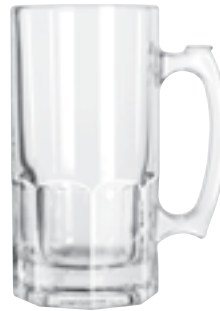
Gibraltar Super Mug No. 5262 34 oz./99.8 cl./998 ml. H8" T4" B4" D6" 1 doz. SCC 001392