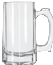
Stein Mug No. 5206 12 oz./35.5 cl./355 ml. H5⅞" T2⅞" B3¼" D4½" 1 doz. SCC 625185