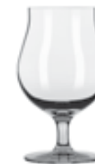
Circa Beer Belgian Ale No. 9170 13 oz./38.4 cl./384 ml. H5¾" T2½" B3" D3½" 1 doz. SCC 638274