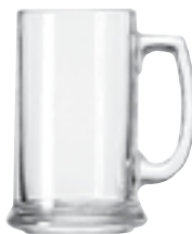
Beer Mug No. 5011 15 oz./44.4 cl./444 ml. H5½" T3" B3⅝" D4½" 1 doz. SCC 492503