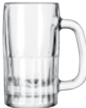
Beer Mug No. 5362 10 oz./29.6 cl./296 ml. H5¾" T3⅞" B3" D4¾" 1 doz. SCC 063311