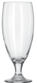
Embassy Pilsner No. 3804 16 oz./47.4 cl./473 ml. H7⅝" T2¾" B2¾" D3⅞" 2 doz./15# • 1.28 cu. ft. SCC 391230