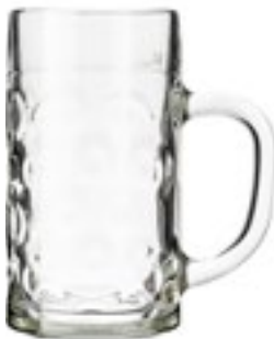
Oktoberfest 0.5L Mug Item No. 1009318 Overflow Capacity 22 oz. H 6½" T 3⅞" B 3½" D 5⅝" 1 doz. SCC L727510