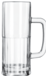
Beer Mug No. 5360 22 oz./65.1 cl./651 ml. H8" T3⅞" B3¼" D5⅞" 1 doz. SCC 021168