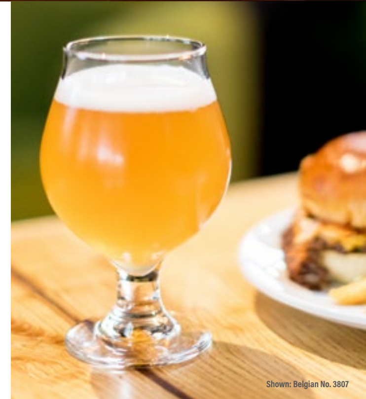
Shown: Belgian No. 3807