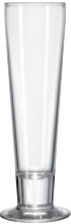
Catalina Pilsner No. 3828 12 oz./35.5 cl./355 ml. H9" T2⅝" B3" D3" 2 doz. SCC 022400