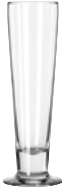
Catalina Tall Beer No. 3823 14½ oz./42.9 cl./429 ml. H9⅞" T2¾" B3¼" D3¼" 2 doz. SCC 852741