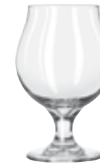
Belgian Beer No. 3808 16 oz./47.3 cl./473 ml. H6" T2¾" B3" D3¾" 1 doz. SCC 440341