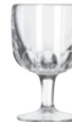
Hoffman House Footed Goblet No. 5212 12 oz./35.5 cl./355 ml. H6½" T4" B3¼" D4" 1 doz. SCC 621958