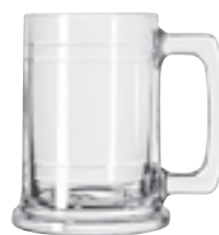
Maritime Mug No. 5027 15 oz./44.4 cl./444 ml. H5⅞" T3¼" B3¾" D5" 1 doz. SCC 495993