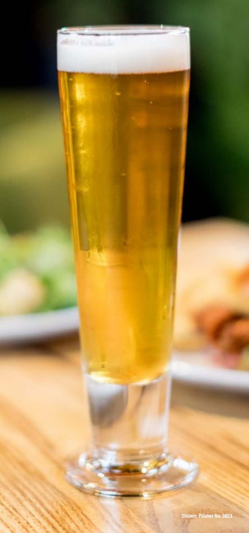
Shown: Pilsner No. 3823