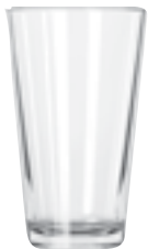
Mixing Glass No. 1639HT No. 5139 16 oz./47.3 cl./473 ml. H5⅞" T3½" B2⅝" D3½" 2 doz. No. 1639HT-SCC 455676 No. 5139-SCC 456499