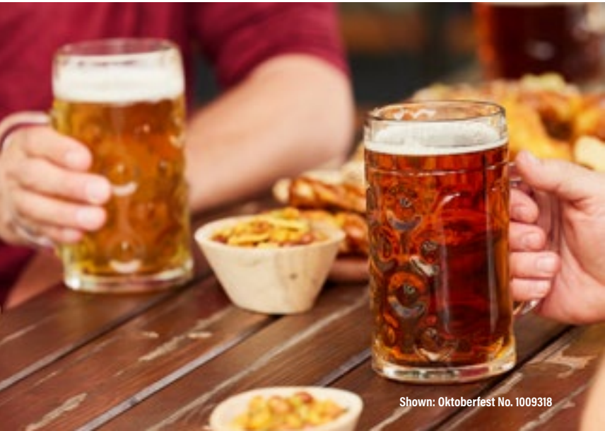
Shown: Oktoberfest No. 1009318