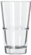
Stacking Mixing Glass No. 15789 14 oz./41.4 cl./414 ml. H5⅝" T3½" B2⅝" D3½" 2 doz. SCC 467098