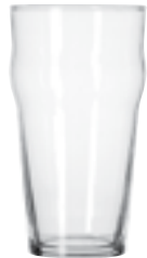
English Pub Glass No. 14806HT 16 oz./47.3 cl./473 ml. H6" T3½" B2¼" D3¼" 3 doz. SCC 005144