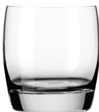
Symmetry Rocks No. 9022 9 oz./26.6 cl./266 ml. H3¾ T3 B2½ D3⅜ 1 doz./8# - .35 cu. ft. SCC 600219