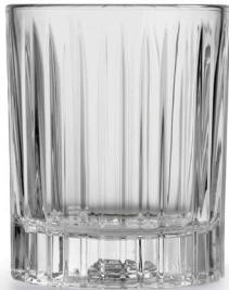
Flashback Double Old Fashioned No. 2934VCP35 12 oz./35.5 cl./355 ml. H4 \frac{1}{8} T3 \frac{3}{8} B3 \frac{1}{4} D3 \frac{3}{8} 1 doz./14# • .42 cu. ft. SCC 8710964824339