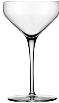
Prism Coupe No. 9329 8 oz./23.7 cl./237 ml. H6½ T3¼ B3⅞ D3¾ 1 doz./5# - .86 cu. ft. SCC 671820