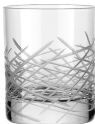
Renewal™ Crosshatch Rocks No. 9034/69477 9 oz./26.6 cl./266 ml. H3¾ T3⅞ B2⅞ D3⅜ 2 doz./18# - .65 cu. ft. SCC 644848