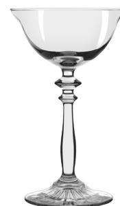
1924 Coupe No. 501308 4¾ oz./14.0 cl./140 ml. H6 T3⅜ B2⅞ D3⅜ 1 doz./4# - .71 cu. ft. SCC 8710964501308