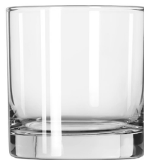
Lexington Old Fashioned No. 2338 10 \frac{1}{4} oz./30.3 cl./303 ml. H3 \frac{1}{2} T3 \frac{1}{4} B3 \frac{1}{8} D3 \frac{3}{4} 3 doz./28# • 1.07 cu. ft. SCC 486182