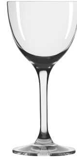
Circa Nick & Nora No. 9252 5½ oz./163 ml. H6 T3 B2⅞ D3 1 doz./4# - .47 cu. ft. SCC 662460