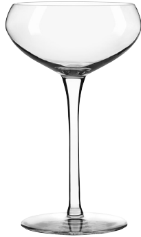
Renaissance Coupe No. 9134 9 oz./26.6 cl./266 ml. H6⅞ T3¼ B3⅞ D4⅞ 1 doz./5# - .97 cu. ft. SCC 636874