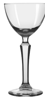
Speakeasy Nick & Nora No. 601329 4¾ oz./28.3 cl./283 ml. H6⅝ T3 B2½ D3 1 doz./4# - .50 cu. ft. SCC 8710964601329