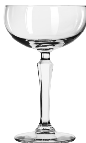
Speakeasy Coupe No. 601602 8½ oz./25.1 cl./251 ml. H6 T3⅜ B2⅞ D3⅜ 1 doz./5# - .73 cu. ft. SCC 10615905601602