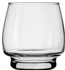
Orbital Rocks No. 12018 10 oz./29.6 cl./296 ml. H3 \frac{3}{8} T2 \frac{1}{2} B2 \frac{1}{2} D3 \frac{1}{4} 1 doz./5# • .33 cu. ft. SCC 686756