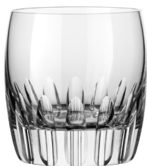
Renewal™ Chisel Rocks No. 9022/69474 9 oz./26.6 cl./266 ml. H3¾ T3 B2½ D3⅜ 1 doz./8# - .35 cu. ft. SCC 644800