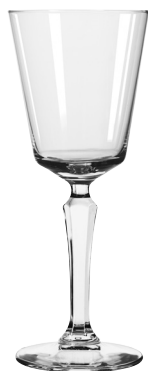
Speakeasy Cocktail No. 603064 8¼ oz./24.7 cl./247 ml. H7⅝ T3 B2⅞ D3 1 doz./5# - .63 cu. ft. SCC 10615905603064

Bourbon bottled at the same ABV as when it came from the barrel (no water added)