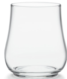
Kearny Stacking Stemless No. 546 17 oz./50.3 cl./503 ml. H4 \frac{1}{4} T3 B2 \frac{5}{8} D3 \frac{3}{4} 1 doz./6# • .50 cu. ft. SCC 700100