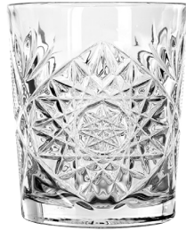
Hobstar Double Old Fashioned No. 5632 12 oz./35.5 cl./355 ml. H4 \frac{1}{8} T3 \frac{1}{2} B3 D2 \frac{1}{2} 1 doz./13# • .46 cu. ft. SCC 10615905924152