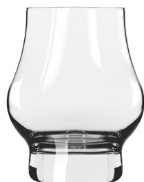
Circa Distill Whiskey No. 9217 10½ oz./311 ml. H4⅞ T2½ B2¼ D3⅜ 1 doz./7# - .41 cu. ft. SCC 661739