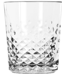
Carts Double Old Fashioned No. 925500 12 oz./35.5 cl./355 ml. H4 \frac{1}{8} T3 \frac{1}{2} B2 \frac{7}{8} D3 \frac{1}{2} 1 doz./13# • .42 cu. ft. SCC 10615905925500