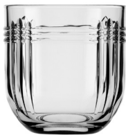
The Gats Rocks No. 2970VCP29 9 \frac{3}{4} oz./29 cl./290 ml. H3 \frac{3}{4} T3 \frac{1}{8} B1 \frac{1}{2} D3 \frac{1}{4} 1 doz./3# • .29 cu. ft. SCC 8710964826982