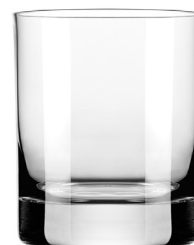
Modernist Rocks No. 9034 9 oz./26.6 cl./266 ml. H3¾ T3⅞ B2⅞ D3⅜ 2 doz./18# - .65 cu. ft. SCC 609656