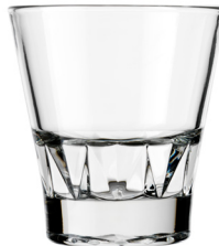
Gallery Rocks No. 15969 8 \frac{3}{4} oz./25.9 cl./259 ml. H3 \frac{3}{8} T3 \frac{1}{2} B2 \frac{1}{4} D3 \frac{1}{2} 1 doz./10# • .41 cu. ft. SCC 686084